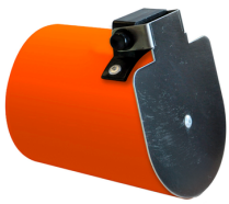
TYPE A (INOX)